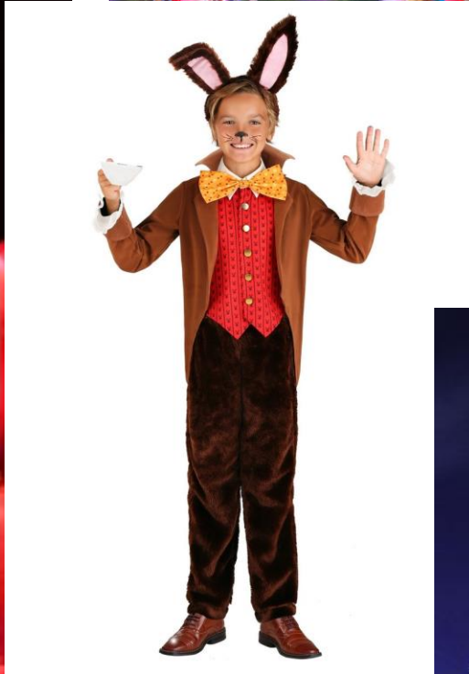
Dormouse and Hare