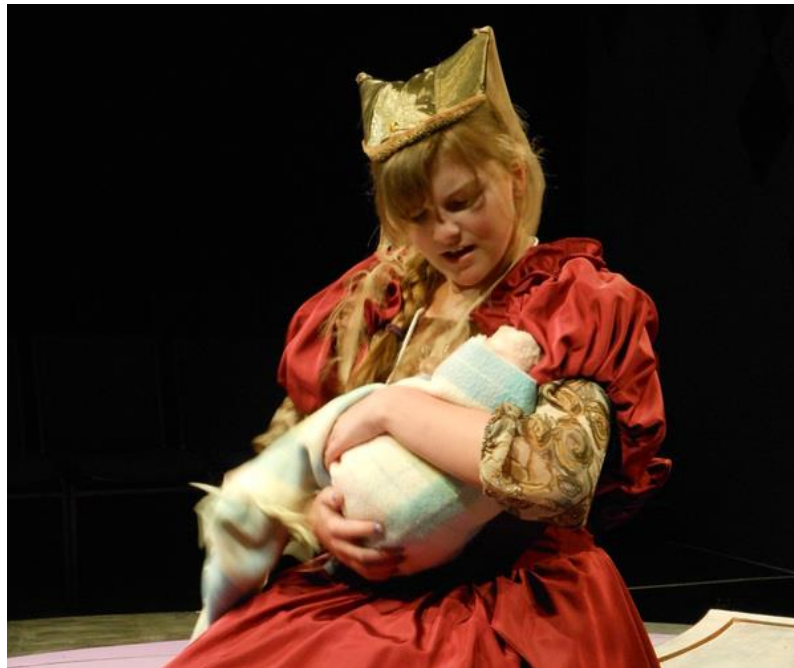
The Duchess (chaos Queen!)

The Duchess is the ultimate "rule-breaker" of Wonderland. While everyone else trembles at the Queen's feet, the Duchess is the only one bold enough to talk back and cause total mayhem.